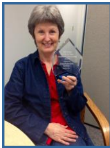
Pausha Peters Crop Production Services

These outstanding individuals were honored for their commitment and dedication to ABC House at our 2014 Celebrate Hope Event.