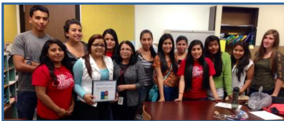
The Dare to Dream Club from South Albany High School decided to donate $1,000 to ABC House from their fundraisers! THANK YOU to this awesome group of students!!!